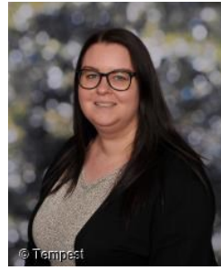
Miss Glen DSL