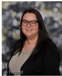
Miss Glen DSL